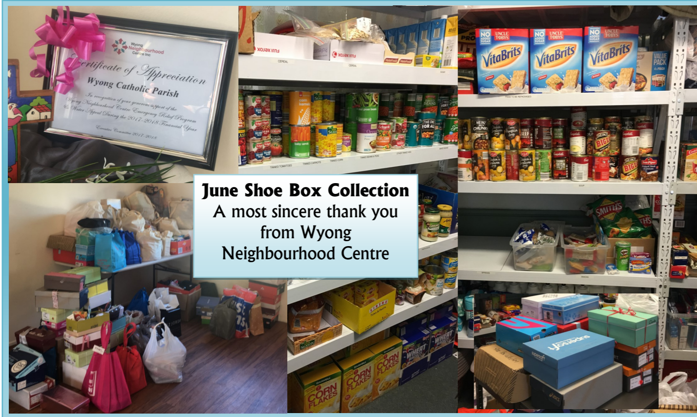
June Shoe Box Collection A most sincere thank you from Wyong Neighbourhood Centre